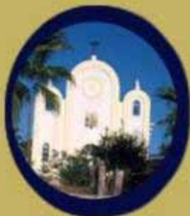
Cathedral in Marseille, France