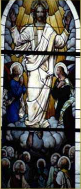
Cathedral in Monaco